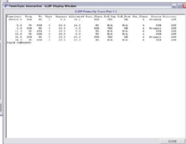
LLDP Trace Menu in PSA Interactive GUI